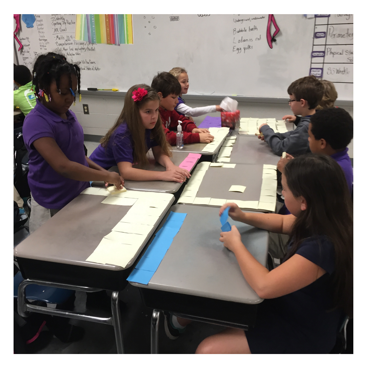
Artifact 6~ Here we are learning about area and perimeter. To apply our knowledge of perimeter and area we also take it into the garden gathering perimeter and area of our tulip garden. A sketch of the perimeter and area of our tulip gardenis created in Google Doc Forms.