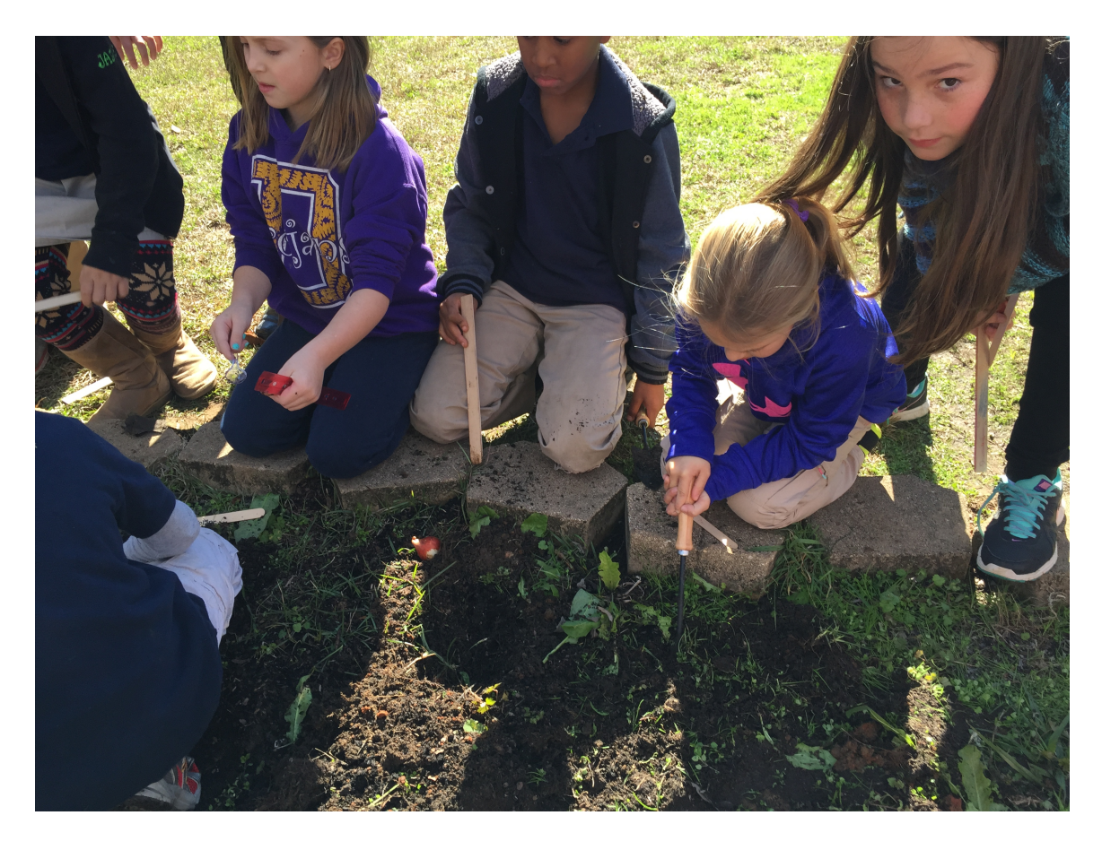
Artifact 5\sim We are measuring our tulips as they have emerged.