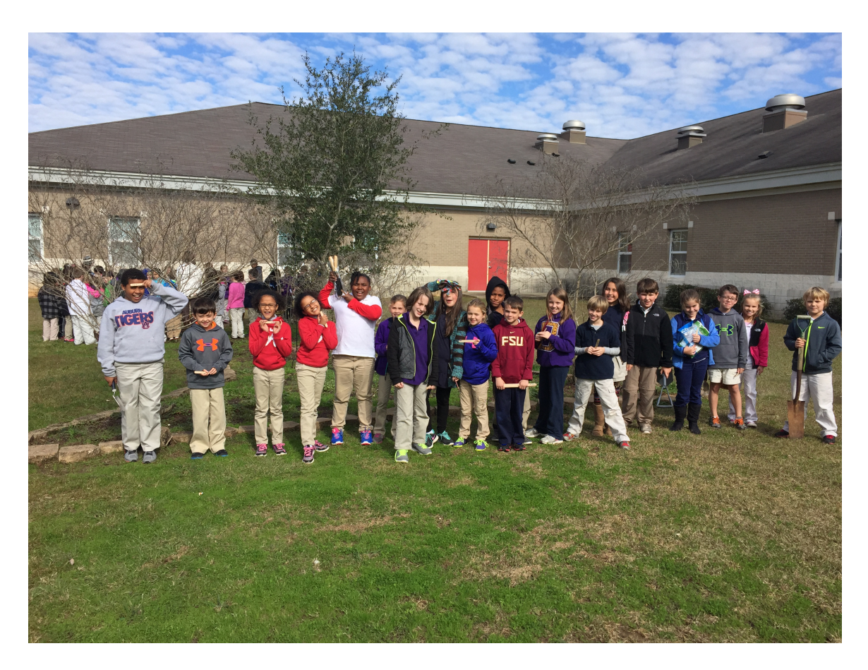
Artifact 3~January 5, 2015 we planted our Tulip Test Garden and reported our tulips planted with the website, Journey North Tulip Test Garden. This site allows us to interact and report when we planted our tulips, when they emerge, and fully bloom. We can compare our map to other climates and places in North America. We also Skyped with a friend in Alaska just for fun to get an idea of the weather there.

granted our request for help in purchasing our tulips. We wrote Thank You letters as well.